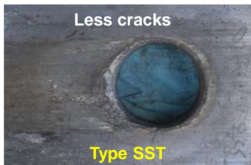
Used plate damage

SHINAGAWA's new slide gate valve "type SST" reduces the working time to exchange plates and increases the plate life.